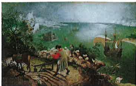
Landscape with the Fall of Icarus